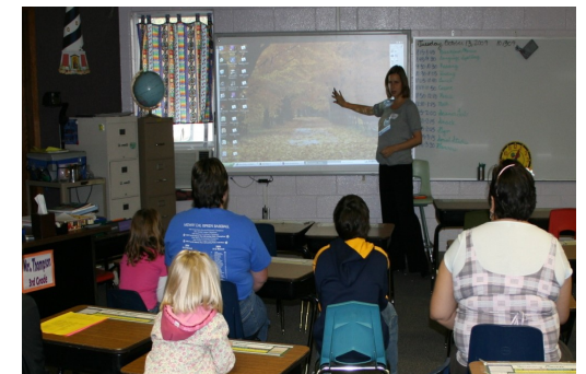
Interactive whiteboard demonstration